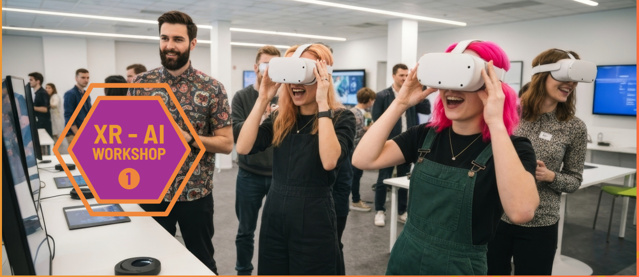
Generative Image by C. Hillmann using Replicate