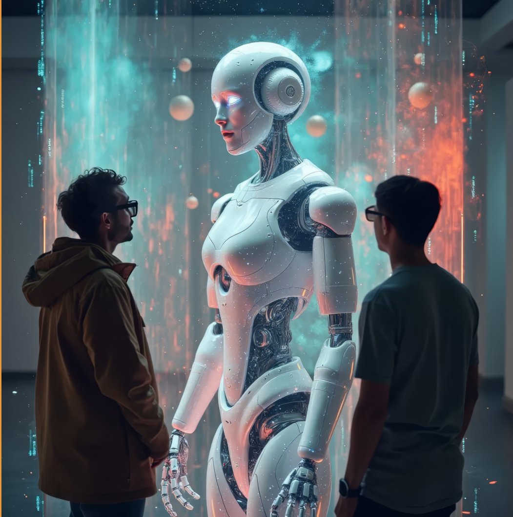
Generative Image by C. Hillmann using Replicate